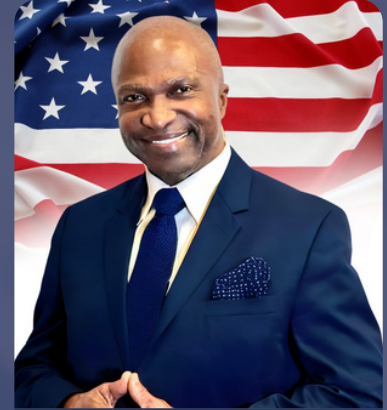
MAYOR ADRIAN O. MAPP Plainfield, NJ

OPENING REMARKS FROM THE NJ OFFICE OF ATTORNEY GENERAL