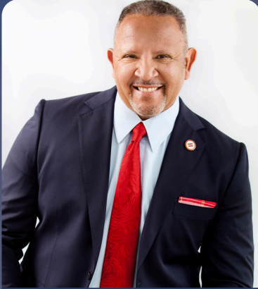
MARC H. MORIAL President and CEO National Urban League KEYNOTE SPEAKER